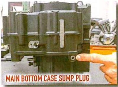
MAIN BOTTOM CASE SUMP PLUG