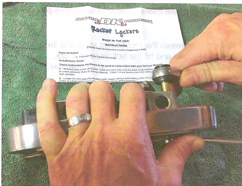
Here, you can see the Rocker Locker fully pressed into the bolt hole, locking the Rocker Shaft in place. No more ticking from the Rocker Shaft rotating and hitting the bolt..